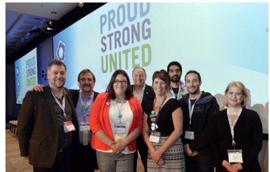
LAST PHOTO OF COMMUNICATION & TECH COMMITTEE