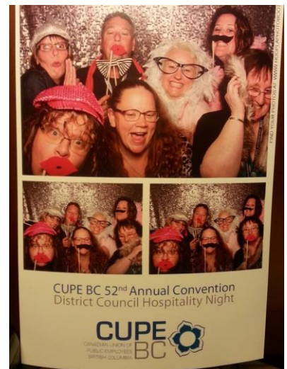
FUN AT THE PHOTO BOOTH!