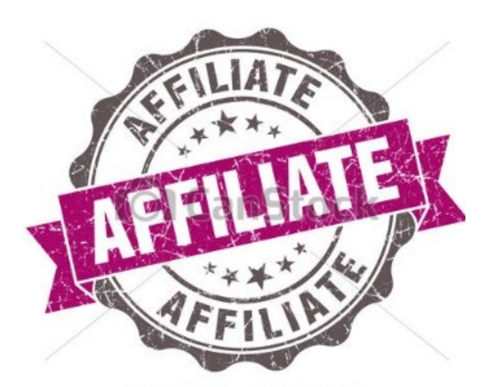
Can Stock Photo - csp19413328