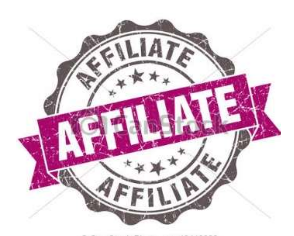
@ Can Stock Photo - csp19413328