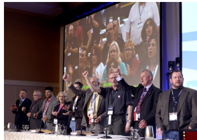
Executive past & present