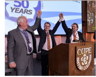
Past, present & our Future!